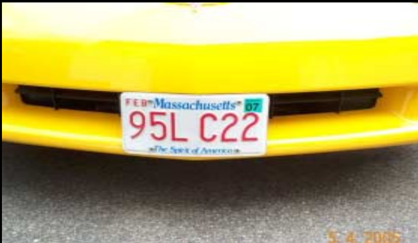
Plate without Frame