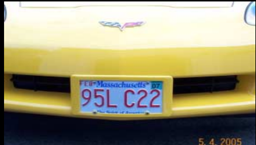
Plate with GM Colored Frame (Colored Frame not Included)